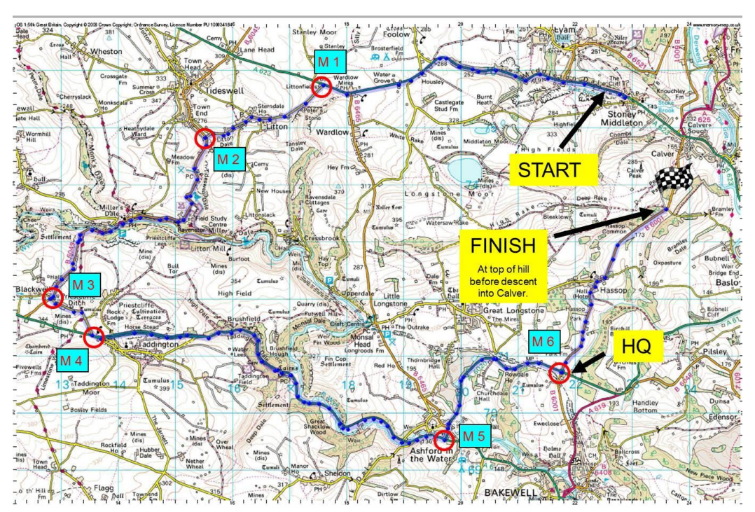
017C Circuit of Longstone Edge.

Warm up: Please avoid warming up on the course towards Ashford once the event has started. There is plenty of road available going south and east from the HQ or north on the B6001 from Calver.